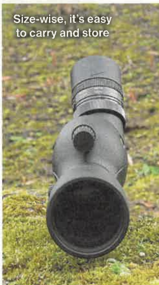
Size-wise, it's easy to carry and store