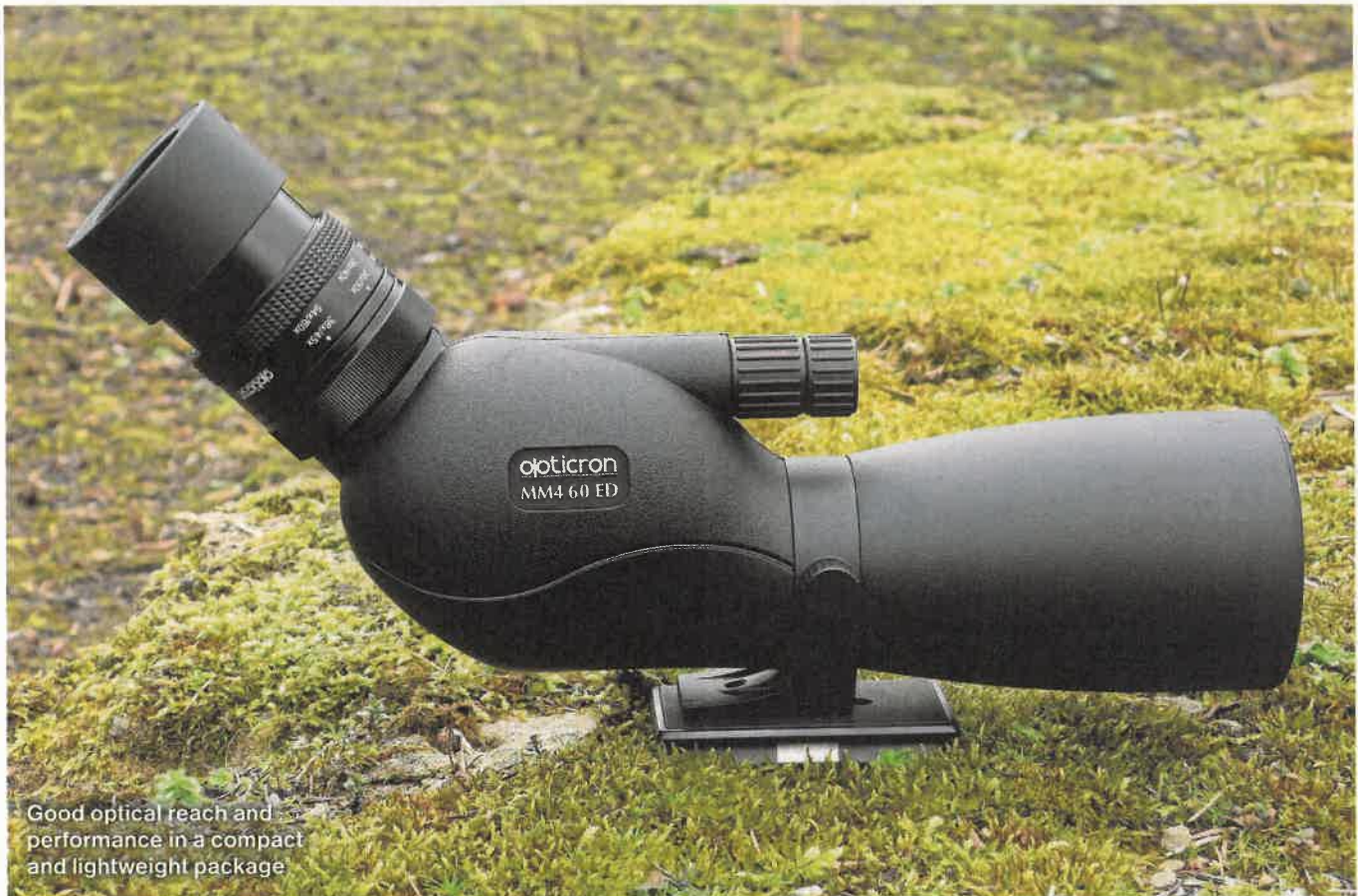
Good optical reach and performance in a compact and lightweight package

something of a feeling of tunnel-vision, but I found myself using it at around 20x most of the time and at this magnification, the field of view and the general image was very impressive.