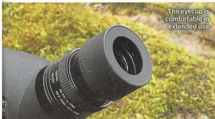
The eyecup is comfortable in extended use